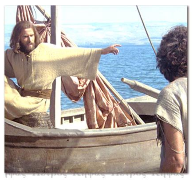
Πέτρος PETER ιφᾶς Πέτρ ιφᾶς Πέτρος Κηφᾶς Πέτρος Κηφᾶς